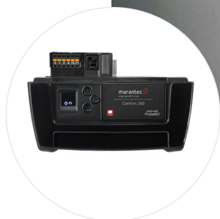
Comfort 260, 270, 280