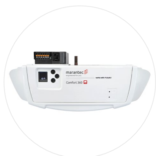
Comfort 360, 370, 380