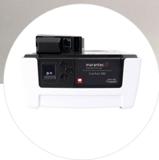
Comfort 260, 270 speed