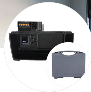
Comfort 260 accu