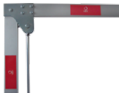
Aluminium arm with articulated joint max. 3 m long