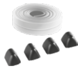
Flexible edge protection